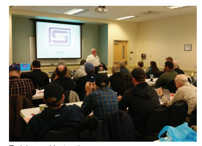
Training and Instruction

Recognizing that superior technical support requires both inside and field-based professionals to properly support the needs of our customers; Spears® Field Technicians are able to assist with multiple customer requests including: